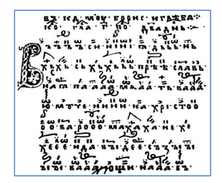
Figure 1. Kondakar notation

The borrowing of vocal ornamentation and its semiological expressiveness from Byzantium was