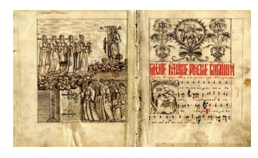
Figure 3. Zolochiv irmologion 1695

actively spread within the European Christian area. Western European educational trends also penetrated into Ukraine in this period. This collectively influenced the establishment of educational centres where liturgical singing was actively studied and reform measures were implemented. A major role in the reformation of liturgical singing was played by the cultural and educational activities of the Lviv Brotherhood.