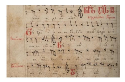
Figure 6. God is the Lord» Lyubachiv irmologion, 1674

At that time, a five-line notation was created among the Lviv brotherhood [12]. This made it possible to introduce polyphonic partes singing into liturgical practice, as well as to record a selected repertoire of Ukrainian sacred monody. Notated hymns were included in the newly created collections – Irmologions. This not only helped to quickly study the liturgical material, but reflected the basic aesthetic principles of the Baroque epoch. Notated irmologions were distinguished by rich ornamentation, bright colors and numerous miniatures and initials – all this emphasised the beauty of sacred chants [17] (figure 3).