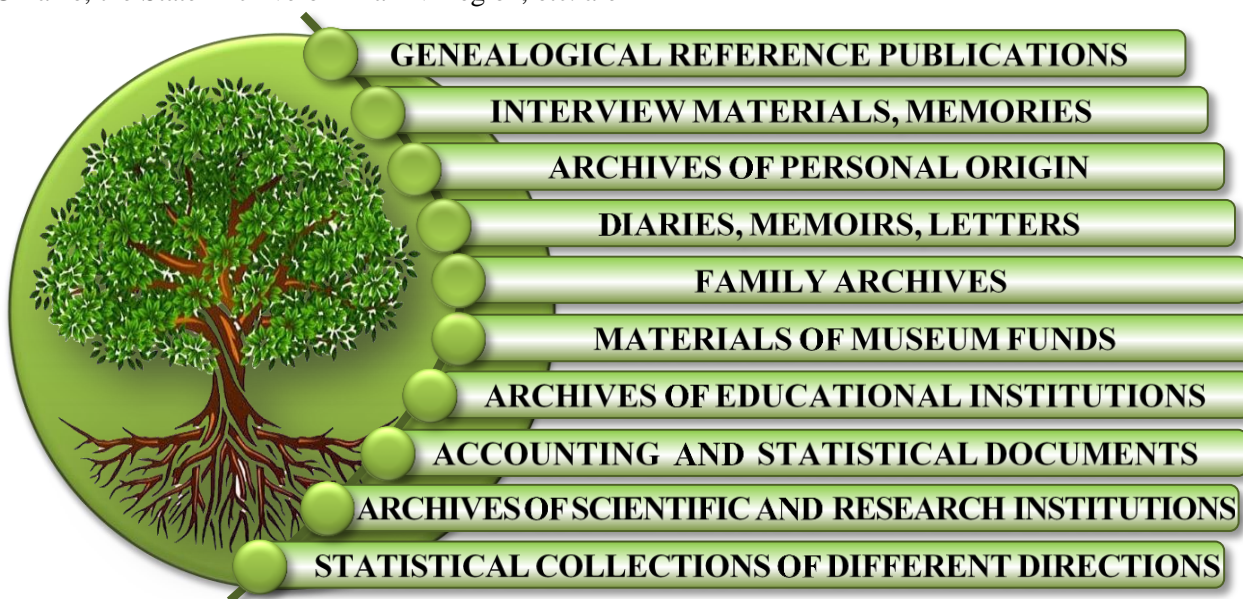
Fig. 1. Components of the source base of genealogical research on the history of science and technology

The representative source base of genealogical research on the history of science and technology should include such sources as family and personal archives, materials from museum collections and scientific libraries, genealogical reference publications, interview materials, and statistical collections of various kinds ( Fig. 1 ).