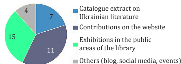
Figure 1. Engagement of CENL members in supporting Ukraine

cultural heritage". The survey aimed to obtain an overview of measures taken by European national libraries to support Ukraine, its libraries, and cultural heritage, and to further coordinate efforts effectively in line with the current needs of Ukrainian libraries and librarians (Fig. 1).